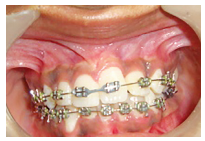
Fig. 1: Intraoral view of the occlusion

and the apical 3rd of the root was curved in a superior direction. The crown of impacted 13 was close to the labial cortical plate and was placed labially to 12 at the level of middle 3rd of the roots of 12 and 11 (Fig. 2).