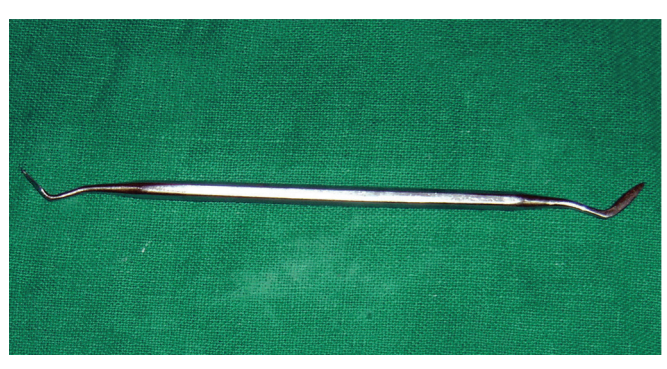
Fig. 6: Hollenback carver, a dental filling instrument