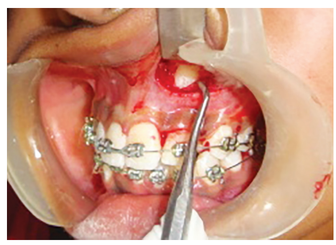
Fig. 4: Impacted tooth being exposed after bone removal using Hollenback carver

16 years; the impacted 13 and 23 were in close contact with the apical 3rd of the root of the lateral incisor, causing the tipping of the lateral incisors.