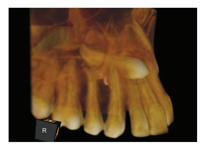
Fig. 2: CBCT showing impacted 13

Mineralization of the canine crown starts at 4 to 12 months of age and completes at 6 to 7 years of age. At the time of eruption, an expansion of the gubernacular canal takes place. The tooth germs are usually in close contact with the apices of the primary canine as well as the lateral incisor and/or the first premolar.<sup>3</sup> During eruption, the canine moves down along the distal aspect of the lateral incisor root in very close contact with it. It has been found that the lamina dura of the lateral incisor facing the erupting canine is frequently missing during their phase of eruption. Due to their close contact the lateral incisor may tip temporarily distally when the canine crown is situated in the apical region and exerts pressure there.<sup>3</sup> As the canine crown passes the mid portion of the lateral incisor root and erupts more coronally, these teeth become spontaneously upright. In a clinical study it has been found that the distal tipping of a maxillary lateral incisor increases from a few percentages in 8-year-old to 10% in 9-year-old and reaches 21% in 10-year-old. By the age of 11 years much displacement is rarely seen.<sup>3</sup> In our case, displacement of the lateral incisor was present even after the age of