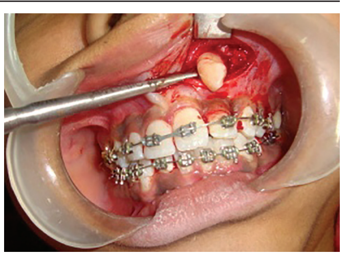
Fig. 5: Impacted tooth finally being elevated out using fine elevator

Pseudoanodontia or impacted teeth occurs most frequently with mandibular 3rd molars, followed by maxillary canines and less frequently by premolars and mandibular canines.<sup>6</sup> In a study of 3,874 routine full-mouth radiographs of patients over the age of 20, Dachi and Howell<sup>7</sup> found 16.7% had at least one